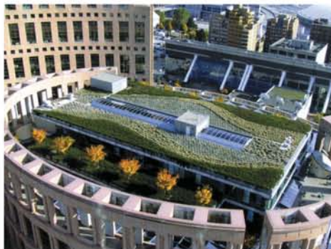
Vancouver Public Library