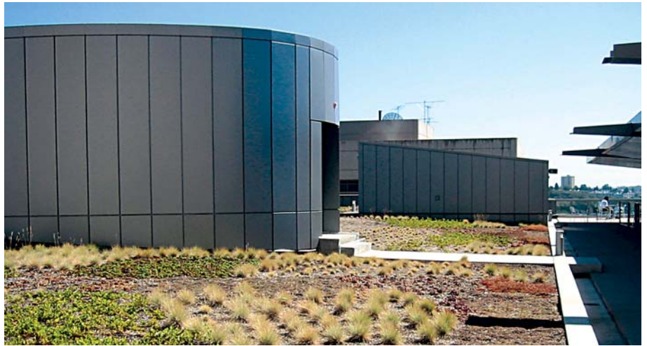
The Justice Center’s 8,500 square foot garden roof, completed in 2002, was the first of Seattle’s two garden roof projects to be completed and was the first ever green roof system installed in a City of Seattle building.

The garden roof could also possibly contribute toward several LEED points for the project — among them, the Sustainable Sites credit for Storm Water Management (one point), the Sustainable Sites credit for