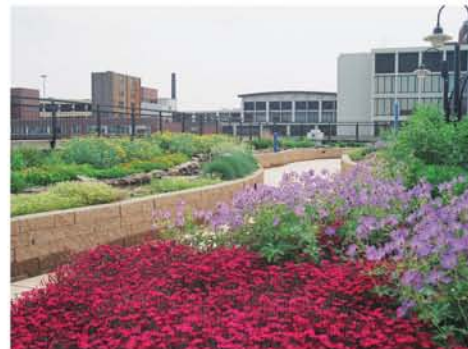
Schwab Rehabilitation Hospital