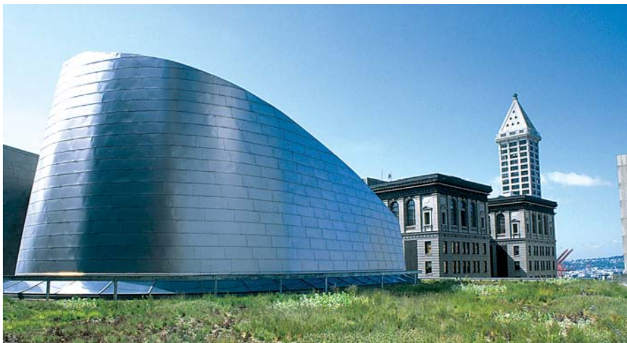
Lush grass and succulents surround a gleaming, titanium-clad Council Chamber atop Seattle's new City Hall, creating an evolving garden roofscape as plants change color with the seasons and the reflective metal changes visual qualities in varying daylight conditions.